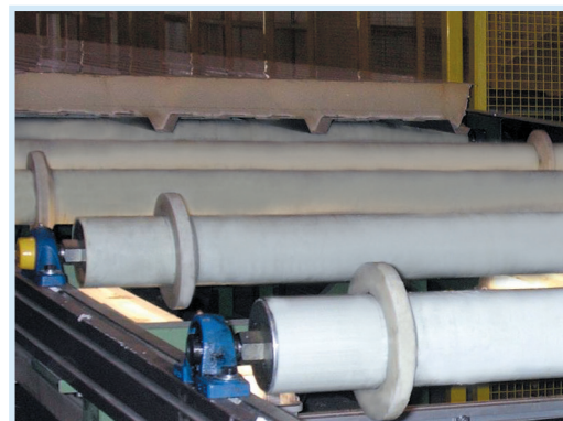
Non-marking surface protects products